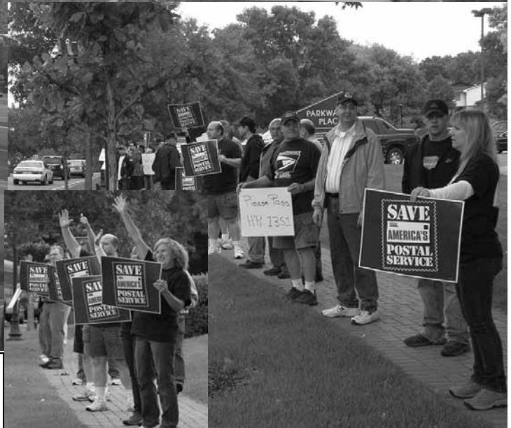
Burnsville rally participants gathered for a group photo. This is what Congressman John Kline would have seen.